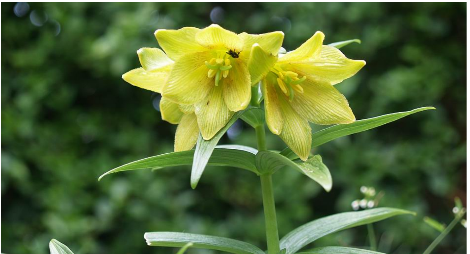
Fritillaria camschatensis yellow

Their dark colour and putrid scent seems irresistible to flies like this one who do a very efficient job of moving pollen around.