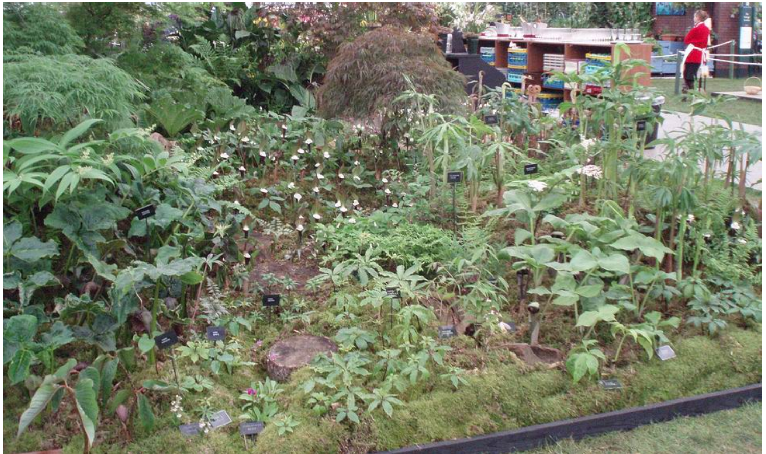
Jacques Amand stand at Chelsea